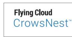
Real-Time Data Defense