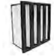
V-Bank Air Filters