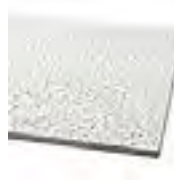
Ceiling Tiles & Accessories