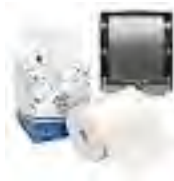
Paper Products & Dispensers