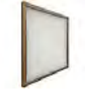
Non-Pleated Panel Air Filters