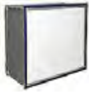
HEPA Air Filters