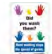
Office & Facility Signs