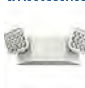
Emergency Lighting & Accessories