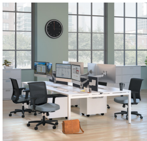
WORKSTATIONS & CUBICLES