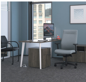
DESKS & SEATING