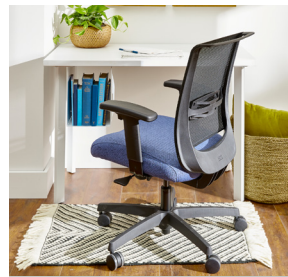
WORK FROM HOME