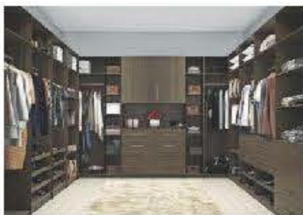
LARGE WALK-IN CLOSETS