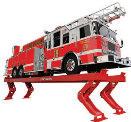
Model IA-10 V-077-A-36F