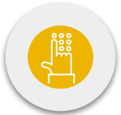
Access to Email