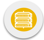
Authentication for Infrastructure