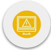
Local Device Access