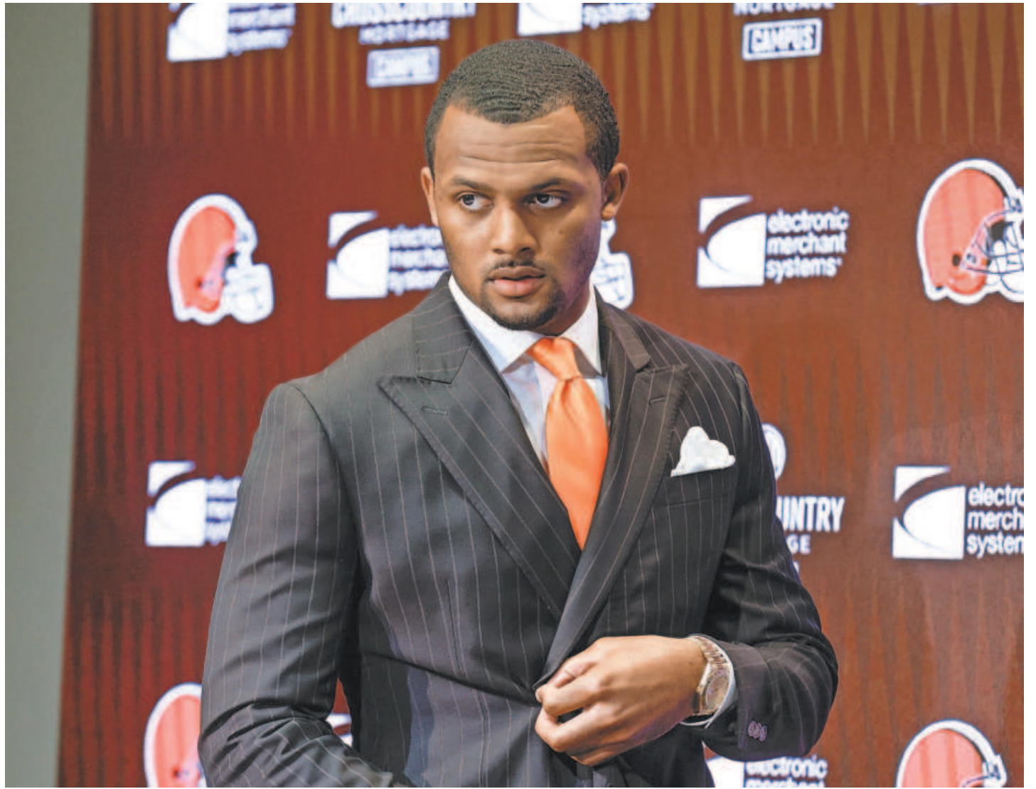
New Browns quarterback Deshaun Watson is facing civil lawsuits from 22 women.

Watson, 26, denies any wrongdoing, and two grand juries declined to indict him on criminal charges in 10 cases that were reported to police. But the 22 civil lawsuits march on separately and have proceeded to dig for evidence that still could affect his future even after getting a record contract with the Cleveland Browns worth $230 million guaranteed over five years. The NFL has said it is monitoring developments and could suspend him for a violation of its per-