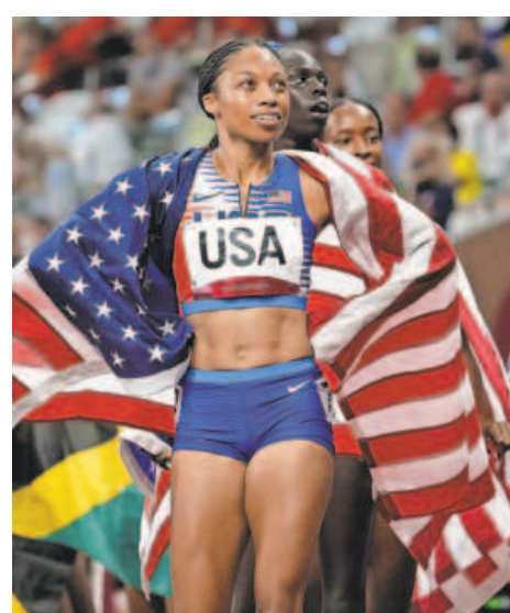
Allyson Felix celebrates after Team USA won the 4x400-meter women's relay at the Tokyo Summer Olympic Games.

final Olympic event. A star-studded foursome of Sydney McLaughlin, Daliyah Muhammad, Athina Mu and Felix cruised to victory with the fifth-fastest time in the history of the event.