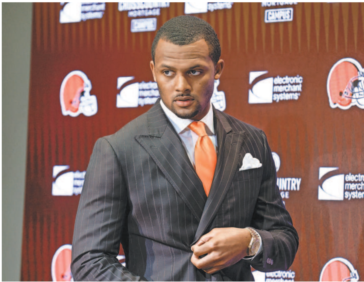
New Browns quarterback Deshaun Watson is facing civil lawsuits from 22 women.

Watson, 26, denies any wrongdoing, and two grand juries declined to indict him on criminal charges in 10 cases that were reported to police. But the 22 civil lawsuits march on separately and have proceeded to dig for evidence that still could affect his future even after getting a record contract with the Cleveland Browns worth $230 million guaranteed over five years. The NFL has said it is monitoring developments and could suspend him for a violation of its per-