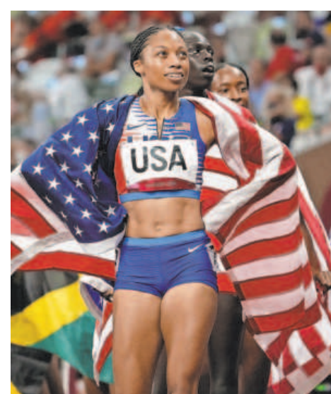
Allyson Felix celebrates after Team USA won the 4x400-meter women's relay at the Tokyo Summer Olympic Games.