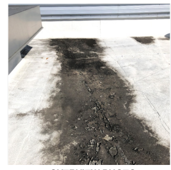
CLOSE UP PHOTO