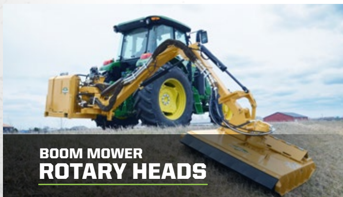
BOOM MOWER ROTARY HEADS