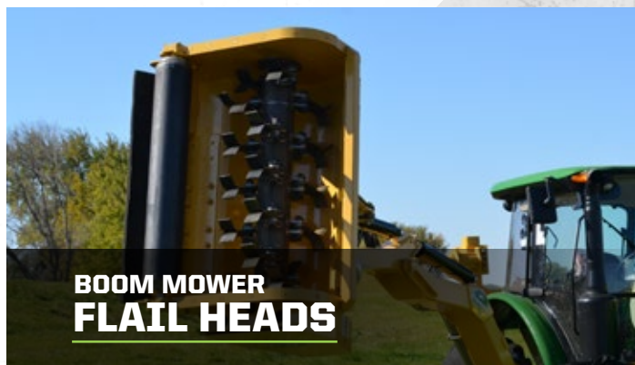
BOOM MOWER FLAIL HEADS