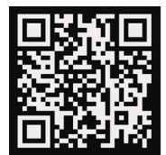
Scan for Full Client List

* The present list is a partial list for quick reference. ** Our installations consist of projects accomplished by our exceptional team of partners and installers.