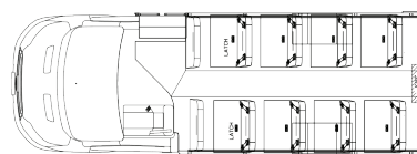
SH400 16 Passenger