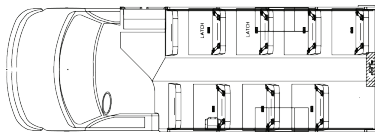
SL400 14 Passenger