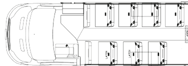
TH/TL400 14 Passenger (non-CDL)